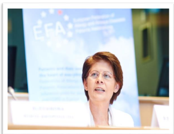
Renate Sommer has been elected Member of the European Parliament since 1999

they cannot eat are in the food they eat”, she underlined. Although the new legislation only requires 14 allergens to be specified, Ms. Sommer stated her intention to call for additional known allergens to be recognised by the European Union and therefore included in the regulation. She also pointed out the need to establish mechanisms to measure and declare foods that might have been affected by cross-contamination of allergens. For MEP Sommer, who also hosted back in 2012 an EFA’s event in collaboration with EAACI on the new regulation on the food provision of food information to consumers viii , “although it is important to give legal certainty to the food industry by including the may contain , we should avoid its misuse”.